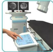
Tableside controls for movement and collimation.